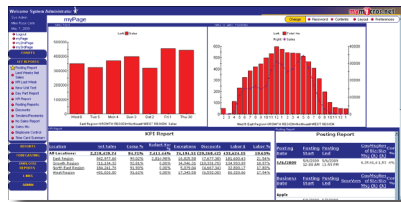
View instant data metrics in real-time.