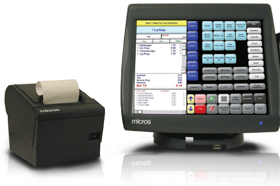
MICROS 3700 Point-of-Sale Solution