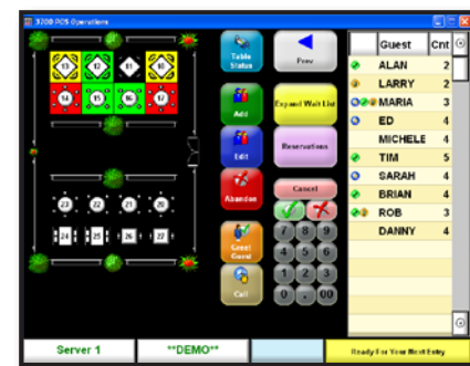
Summary waitlist view displaying guest name and number in party