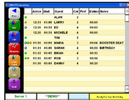
Detail waitlist view with notes

MICROS TMS provides intuitive reporting that manages useful feedback to the restaurant operator. In addition to wait times, MICROS TMS reports on the abandonment rate, which determines the length of time between seated and greeted by server and order time. When combined with MICROS KDS, MICROS TMS provides end-to-end guest experience reporting by capturing greet and promise times until check closed to table ready time. TMS can roll-up to mymicros.net to provide a comprehensive reporting tool.