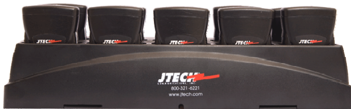
ServerPass 10-slot charger

The ServerPass™ pager provides a durable, low profile silent vibration pager designed for the rigors of the restaurant environment.