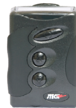
InstaCall™ Manager Pager